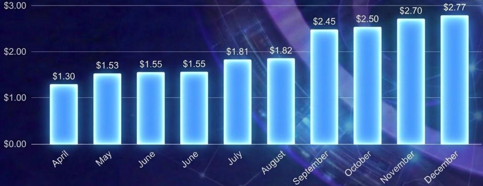
CCDS - Share Price Fair Value - 2026