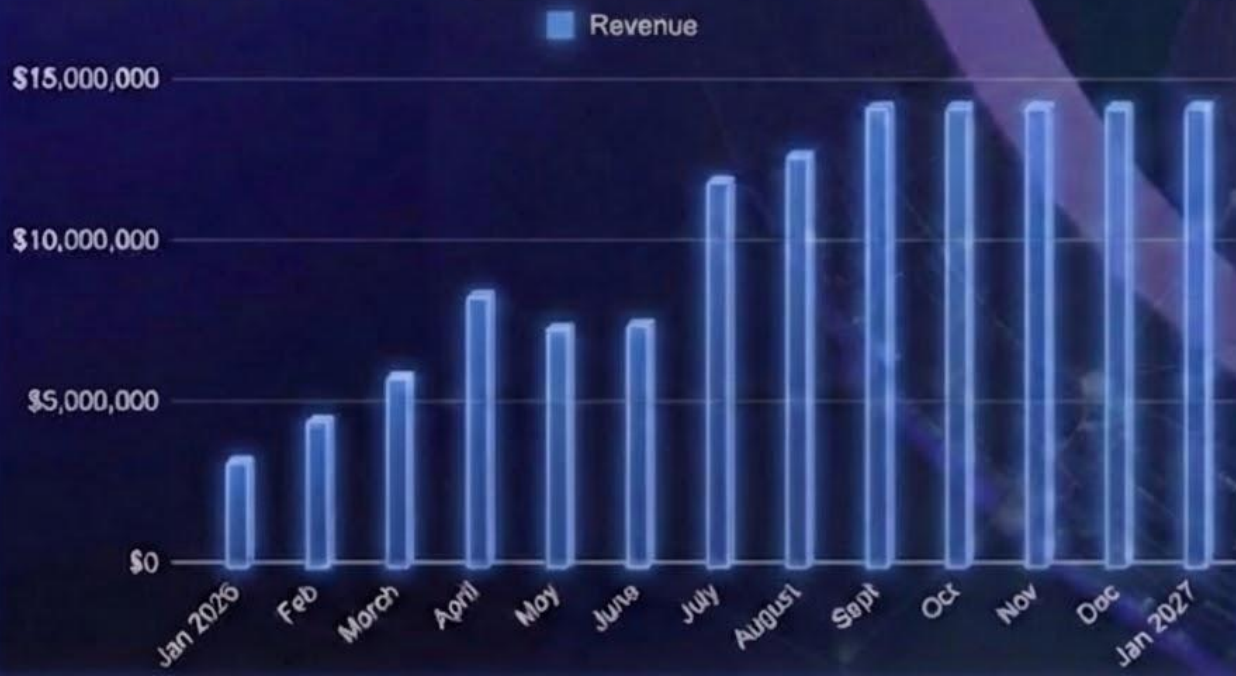
Revenue - ARR